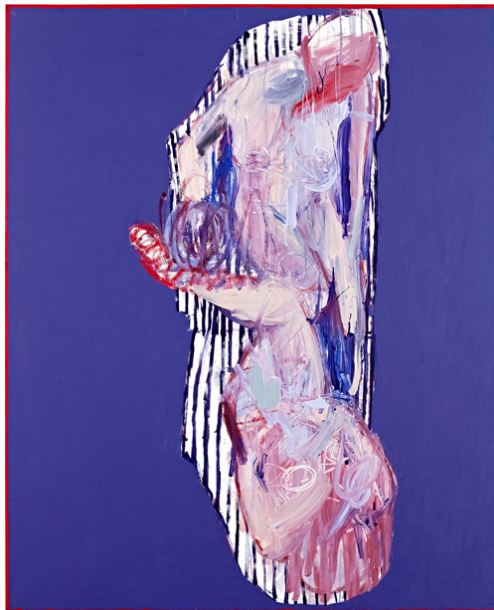
Drawing Room Study 7 2008 Acrylic and oil on canvas 198 x 163 cms 78 x 64 1/8 ins http://www.robertfrystudio.com/index.php?page=drawing-room-studies

His earliest series, The Drawing Room Studies , consists of ten works on canvas, on which he pictured himself as a model. These series developed gradually from his etchings made three years before. In Drawing Room Study 7 two figures constitute a mirror image connected by an intimate link of their mutual relation. This sight gives an impression of being filled with riddles, paradoxes and tautness, which are indicated by the use of many contrastive hues, accumulation of rough lines and stripes, geometrical outlines.