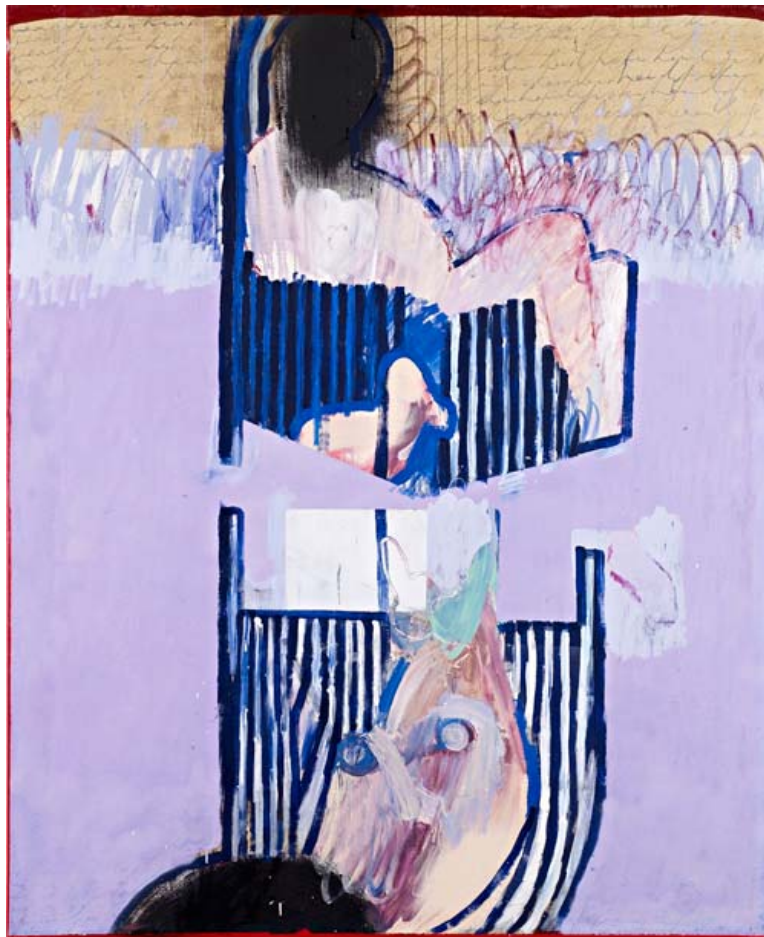
Drawing Room Study 4 2008 Acrylic, oil and marker pen on canvas 198 x 163 cms 78 x 64 1/8 ins

“Etching can involve a vast amount of precision and technique and has its constraints. The immediacy of painting is very different; these works express a kind of freeness and looseness in the way paint is applied and attempt to embrace the versatility and multitude of ways in which it can be used. I’m fascinated by the spectrum of paint as a medium, its vastness and its complexity. Drawing Room Study 4 repeatedly engages different materials within the composition. It attempts to achieve meaning through their varied application, and create relationships between the properties of the materials that construct the work. The Drawing Room Study series are equally concerned with the way they’re made as the themes the pictures explore; it’s perhaps indistinguishable as to which is of greater importance.” 68