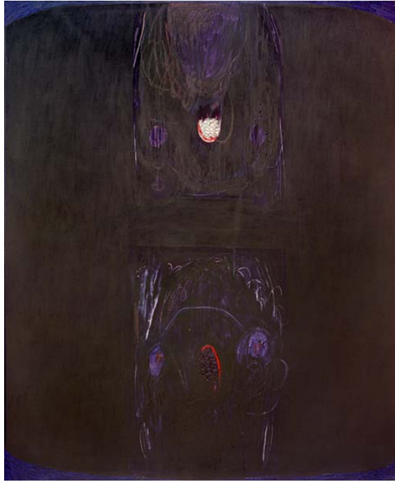
Purple Study 2 2009 Acrylic, oil, enamel, gloss paint and marker pen on canvas 198 x 163 cms 78 x 64 1/8 ins

http://www.robertfrystudio.com/index.php?page=purple-serie