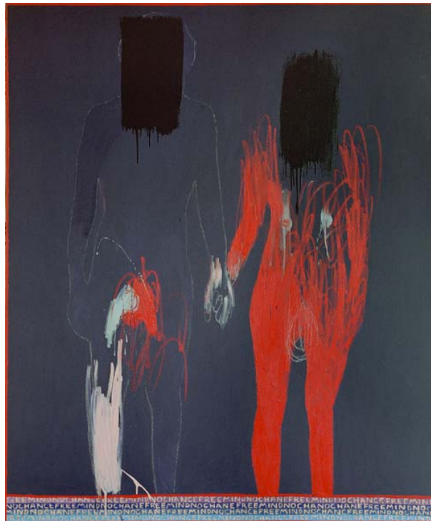
Purple Study 9 2009 Acrylic, oil, enamel, gloss paint and marker pen on canvas 198 x 163 cms 78 x 64 1/8 ins

psychological mirror. The female figure is strongly accentuated with red paint in place of her legs, then it becomes lighter as we move our sight upwards to the scrawl of her shoulders. The male shape is devoid of colouring at all his parts except the leg and the symbolic merging of cool and warm contrastive shades in his intimate areas. Their sexual features have been indicated by specific application of paint resembling graffiti. Yet the most arresting characteristic of this painting is the artist's choice to hide the faces of his protagonists' faces with coarse black covers of thick gloss paint flowing down the borders of rectangular shapes. In this way the creator stripped of these characters of their personalities and the spectator might think he made his artistry indistinct on purpose. The message of this work lies inscribed in the repeated stream of letters 'FREEMINDNOCHANCEFREEMINDNOCHANCE...' which we read down the canvas. As Gair Burton infers, this manipulation " is a denial of the possibility of mental autonomy ". 74 According to his interpretation, the couple represents surrendering of the self coinciding inevitably with losing sense of freedom. Fry explores this theme throughout most of his works using various means of expression.