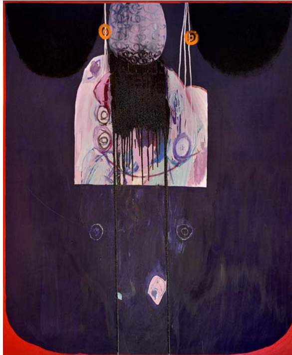
Purple Study 3 2009 Acrylic, oil, enamel, gloss paint and marker pen on canvas 198 x 163 cms 78 x 64

previous works, here undergo a process of simplification and vagueness. In work number 3 the structural components of the body, such as nipples, faces, genitals look extremely abstract. The author uses this means to make the identity uncertain and put the individual existence into doubt.