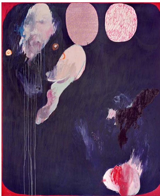
Purple Study 5 2009 Acrylic, oil, enamel, gloss paint and marker pen on canvas 198 x 163 cms 78 x 64 1/8 ins

The composition presents a man with his face dripping down the canvas as if his existence or personality were melting down.